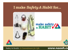
S PHOTO FRAME SOLD OUT