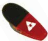
K MAGNETIC CLIP