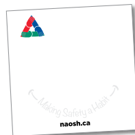
M POST IT NOTES