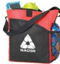
I LUNCH BAG